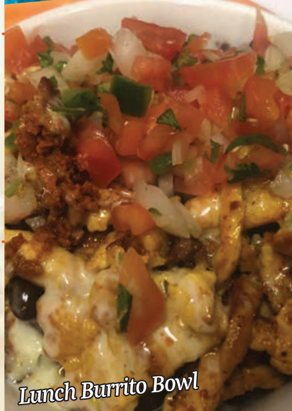
Lunch Burrito Bowl

AN 18% GRATUITY SUGGESTED FOR PARTIES OF 7 OR MORE.