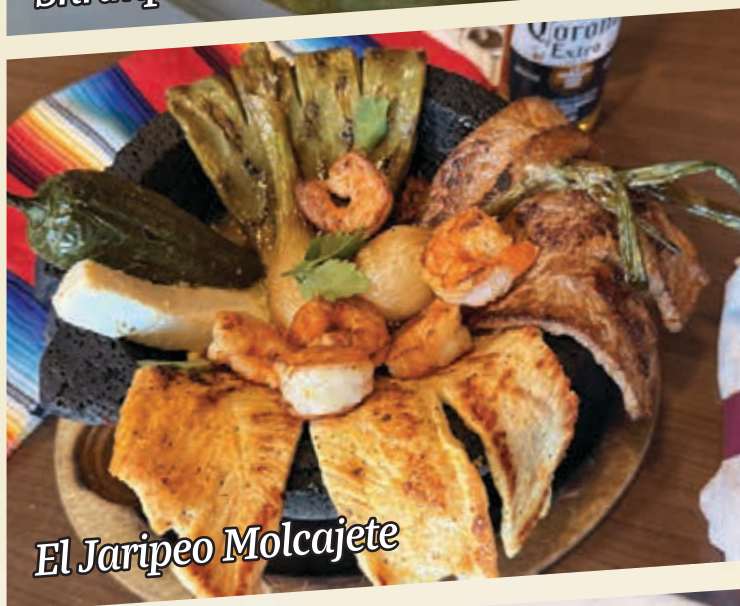
El Jaripeo Molcajete