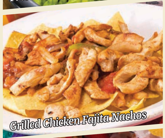
Grilled Chicken Fajita Nachos