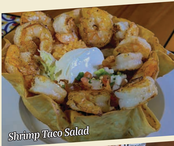
Shrimp Taco Salad

*Notice: Foods cooked to order - Consuming raw or undercooked meat, seafood and eggs may increase your risk of foodborne illness.