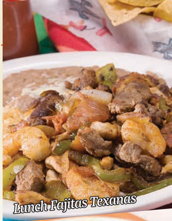
Lunch Fajitas Texasas

Grilled chicken, chorizo, Mexican rice and black beans garnished with our delicious queso sauce and fresh pico de gallo - 10.99 Steak - 11.99